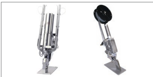
Table Top Clippers

For companies looking for solutions for packaging turkey sausage, deli meats and other processed poultry products, TIPPER TIE offers a full range of automatic clipping machines such as the TN4000 family, TT1815/1512, RS4204 and SV4800. These machines can take your pumpable or hand laid product and produce consistent chubs of meat at virtually any diameter.