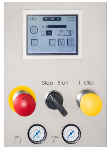
The KDCMA is operated via a touch screen.