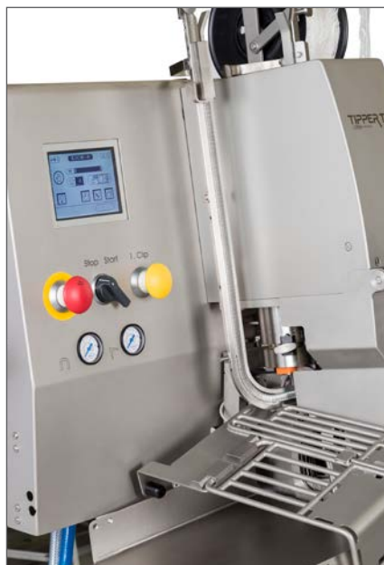
Easy to clean thanks to smooth surfaces.

Touch screen, 50 storable, readily accessible programs. The KDCMA is operated via a touch screen. This modern operating system with internationally recognized icons leaves nothing to be desired in terms of convenience, hygiene and efficiency. The user interface comprises the functions stop counter, portions per minute, system setting menu, machine switch menu, fault report, product setting menu, fault position, loop test, label test, display of stuffer start.