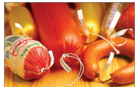
Sausages with labels