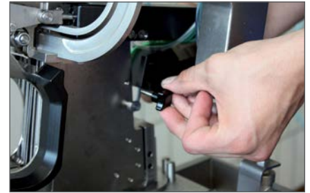
Service-friendly: knife replacement without tools

See video of the KDCMA at youtube.com/tippertiegrou