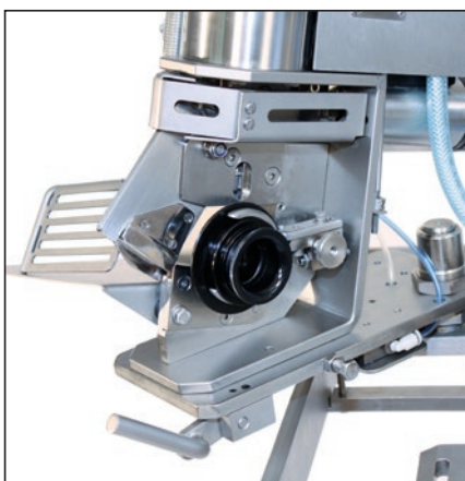
Easy opening of clip head for fast casing reload.