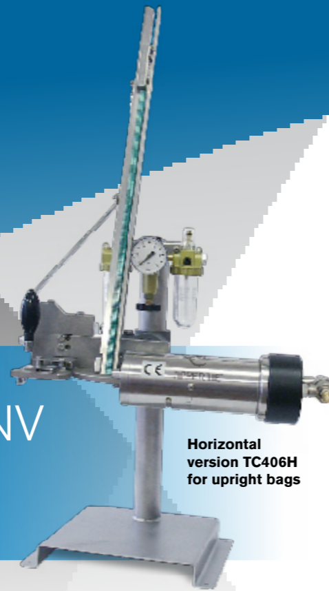
Horizontal version TC406H for upright bags

TCV table-top clippers are used wherever absolutely secure closure is needed. Sausage, poultry, game, mussels and clams as well as packaged fresh meat and cheese can be sealed with these machines.