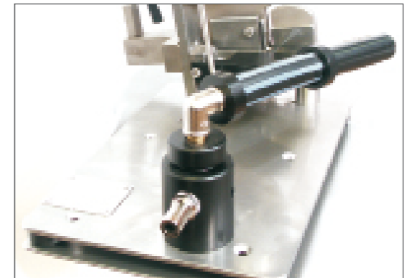
Pivotable extractor pipe for vacuum packaging