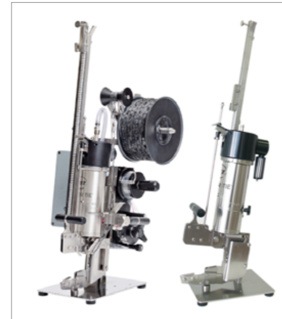
TCNV model with automatic loop feeder and TCNV model with pneumatic cutting knife