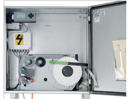
Labels and printing system are installed in a hermetically sealed stainless steel housing.