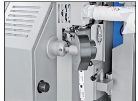
Labels are printed with the printing system and clipped into the exact position via the label dispenser.