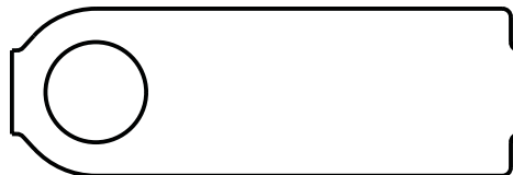
Label original size

The TagPrint TD60 labelling system is positioned behind the clipper and is fixed with the fixing rollers. A communication cable connects the TD60 to the clipper. The labels are fed from the roll into the printing system and printed by thermal transfer. The labels printed on one side run via the label dispenser into the clipping area of the clipper. Then the label is placed into the clip and cut off. The system is controlled via the clipper, or with a separate PLC. The cycle time of the clipper is not reduced by the insertion of the labels.