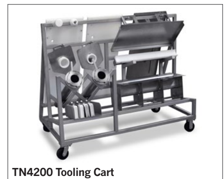
TN4200 Tooling Cart

TIPPER TIE Inc. 2000 Lufkin Road Apex, NC 27539 USA Tel. +1 919 362 8811 Fax +1 919 362 4839 infoUS@tippertie.com