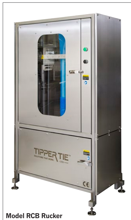
Model RCB Rucker

The TN4200 is available with an optional tooling cart for convenient storage of removable parts and tooling. It features all stainless-steel construction and sloped surfaces for easy washdown. Two sizes are available.