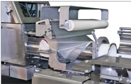
The optional collagen film module enhances the appearance of ham products with an attractive sheen and patterned netting.