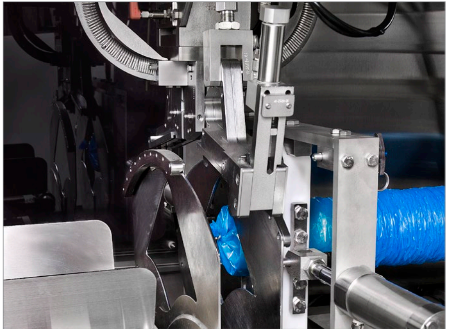
Robust RS style clipper and voider package for consistent, secure clip closure.

The TN family uses cutting edge servo technology to enhance many processing benefits and heighten productivity. The unique servo-powered breech of the TN4200 tightly compresses larger and longer cuts, creating more uniform product shapes and diameters. For maximum productivity, the fast acting servo-driven pushing unit provides a degree of control unachievable with pneumatic systems. This practical use of servos