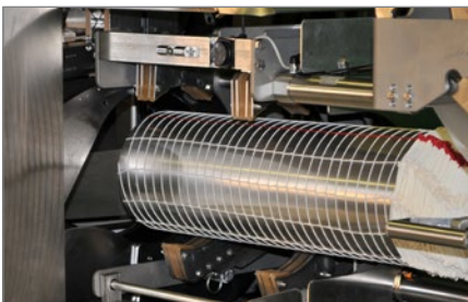
Deruckers provide even and consistent distribution of the netting per product piece for optimum netting efficiency.