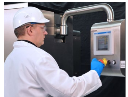
Fully adjustable pusher speed and pressure based on product requirements.

The critical distinctions between the TN4001 and TN4200 are speed, length of the whole muscle